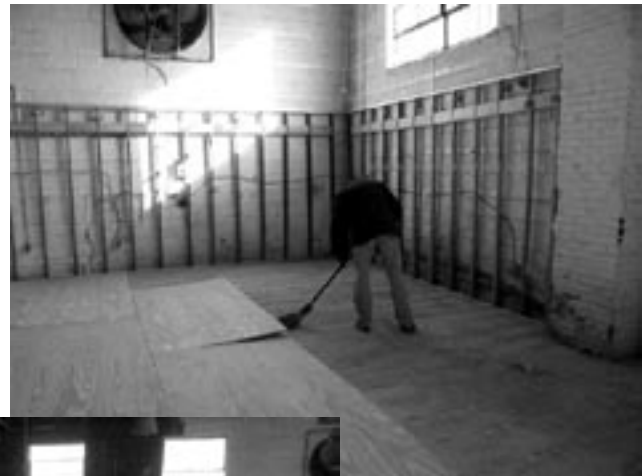
Radiant heat floors.