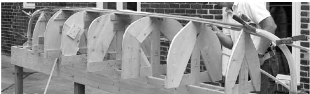
Open shop's project: the 14 ft. cruiser canoe.(below)