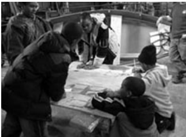
ASF Afterschool Program with the Boys and Girls Club.