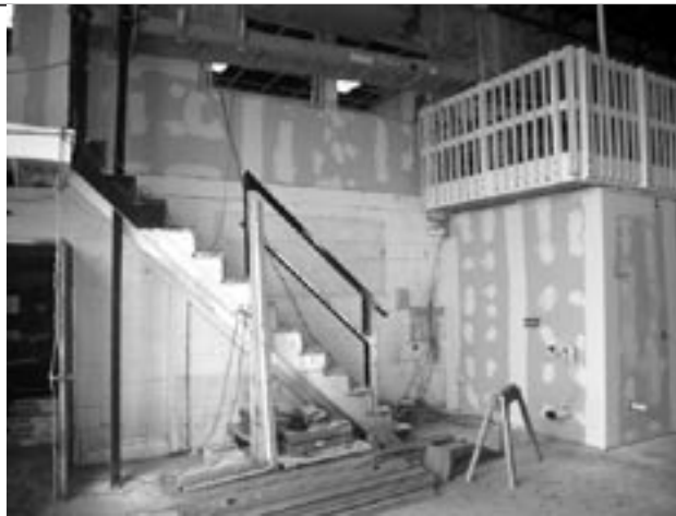
Stairway to heaven.