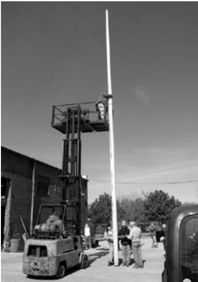
Checking the mast. Is it as long as it is tall?

Come loft the Haven 12 ½. It's a lovely, Herreshoff-inspired 16 ft. daysailer. Starting with 1.5" to 1" plans, we'll lay out a full-size working drawing of the boat. From this, we will be able to make the molds, backbone patterns, and bevels necessary to start building the craft. You will learn what all the lines mean and how they interact.