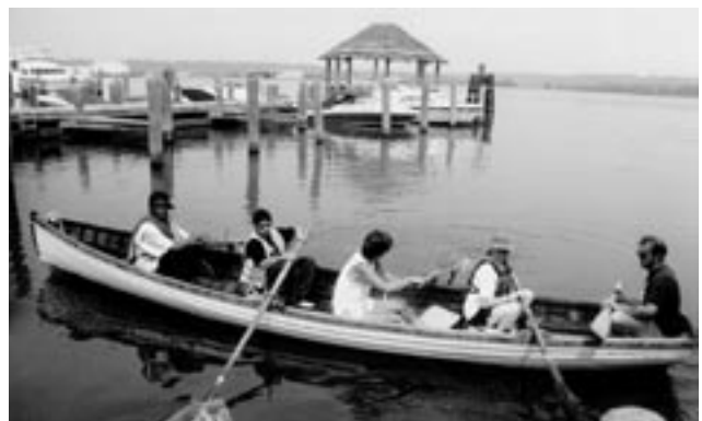
The gigs are back, the gigs are back! (above)