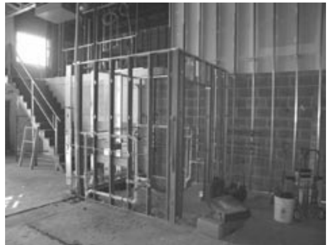
Built Upon a Dream—new office, new classroom, new bathroom!

Without jinxing anything, the project is scheduled to finish before Christmas. When it's done, we'll have a modern training center able to accommodate the growing needs of our community.