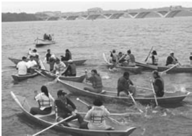
And they're off!