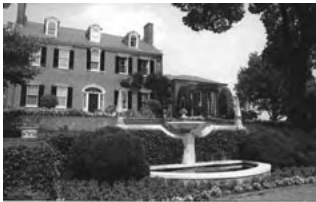
Evermay- In all her splendor