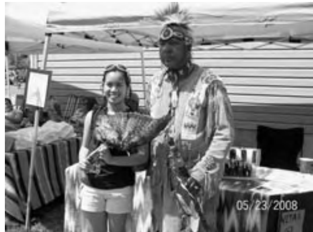
Scenes from the Mattaponi Pow Wow.

Other men sported Mohawks, face paint, or bright fabrics, depending on their tribe and personality. In the circle, their movements ranged from the traditional shuffle step to pantomime stalking to a wounded careening. Women wore fringed, beaded dresses and danced with fluid stillness, their eyes cast down demurely.