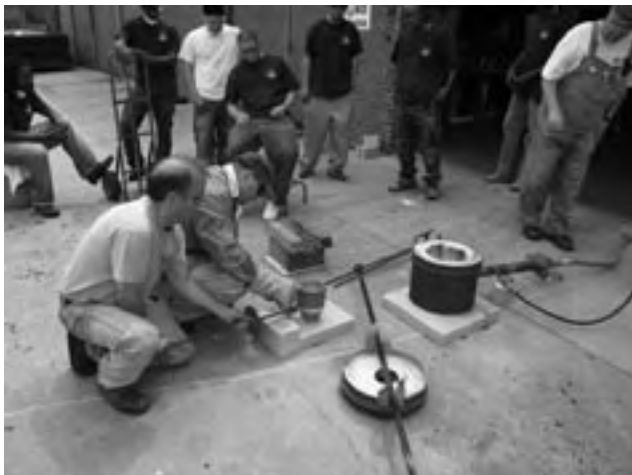
Hot Metal- Pouring at the Bronze Casting Class.

Eight students lofted two boats. We had to use all of the Seaport Center. The downstairs crew drew the 14 ft. double-ended, lapstrake canoe "Our Cruiser." The boat was originally built in 1887 by the R.J. Douglas Company of Waukegan, Illinois. Its design is documented in John Gardner's Traditional Small Craft , Vol.2. The upstairs crew drew a 14 ft. row and sail boat documented in W.P. Stephens Amateur Boat and Canoe Building . The lines for this boat are pretty skimpy; our students deserve credit for developing a fair shape from the information provided.