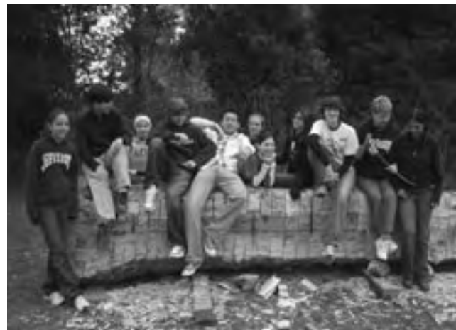
The log and kids that started it all.