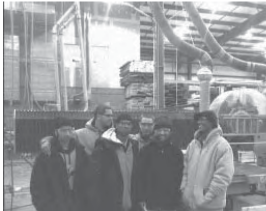
Visiting Hardwod Artisans