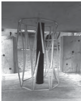
Under the Crusher!

Our graduates are meant to go out and build. We try and make their time with us as relevant as possible. We also try to challenge them and expand their horizons. This year, we're using a problem from the international competition, Odyssey of the Mind. The basic challenge is to build an 18 gram structure out of 1/8" balsa wood and see how much weight it can hold before it's crushed. We're using this problem to teach basic measuring and geometry, as well as the history of buildings and structural analysis. Initial designs are carrying 100lbs, so far. (The record in Virginia is 1,400 lbs.)