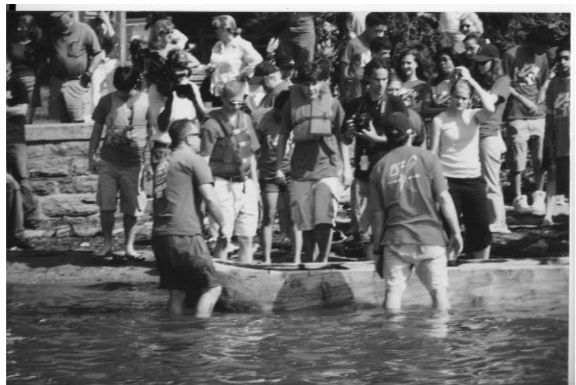
Into the water!