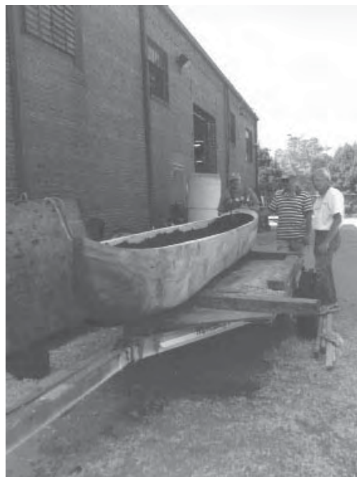
The boat back at the shop for final shaping