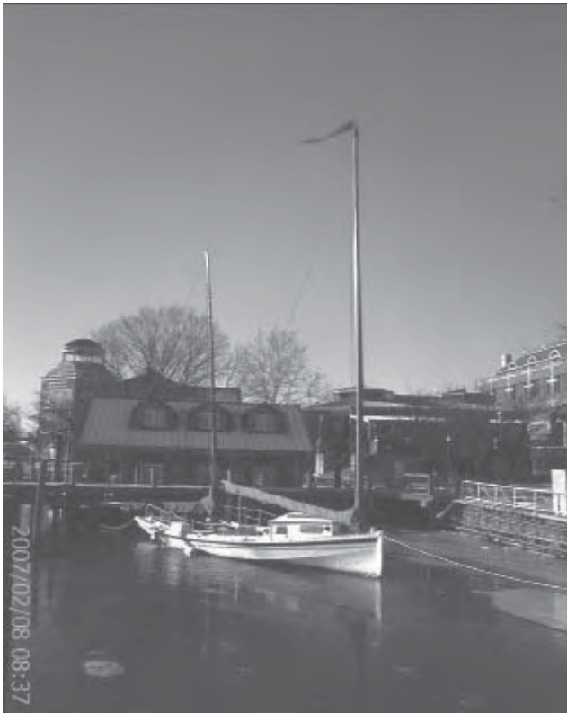
The 'Potomac' at the Seaport Center during this winter's ice