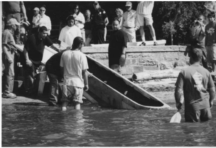
Down the ramp