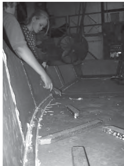
Scraping off the bedding compound