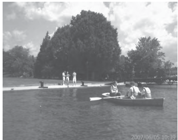
In the water, at a very high tide. Good timing.