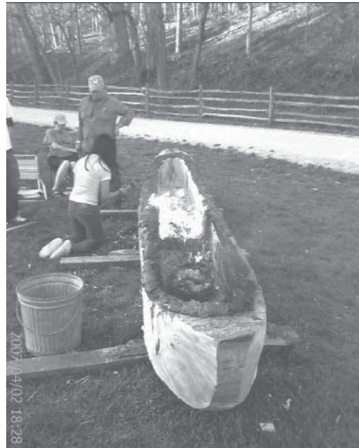
Burning the boat with clay as protective insulation

The boat will be displayed alongside John Smith's Shallop at the Smithsonian's Folklife Festival on the National Mall, June 27 through July 8.