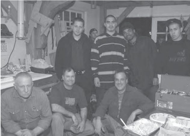
The latest graduating class