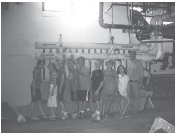
The building team and the disassembled "Renewable" Bevin Skiff