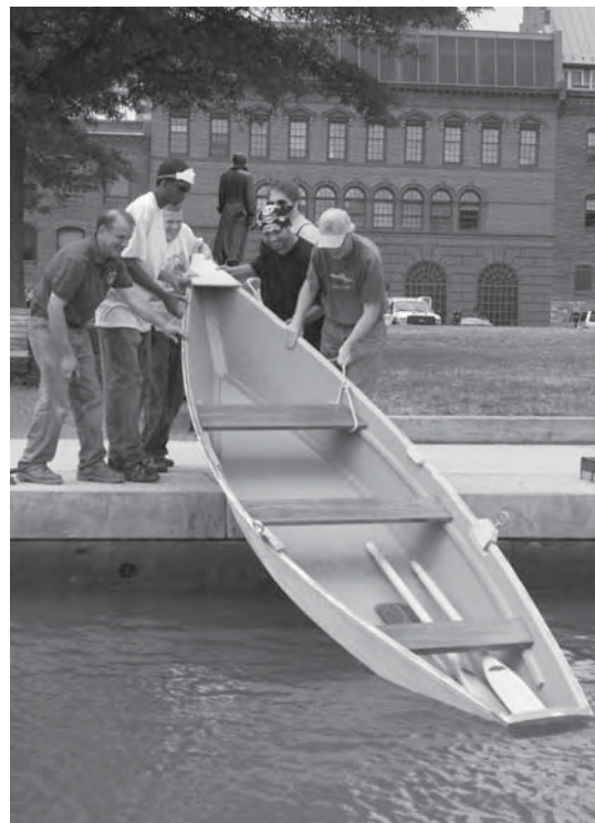
Launching the Challenge Wherry