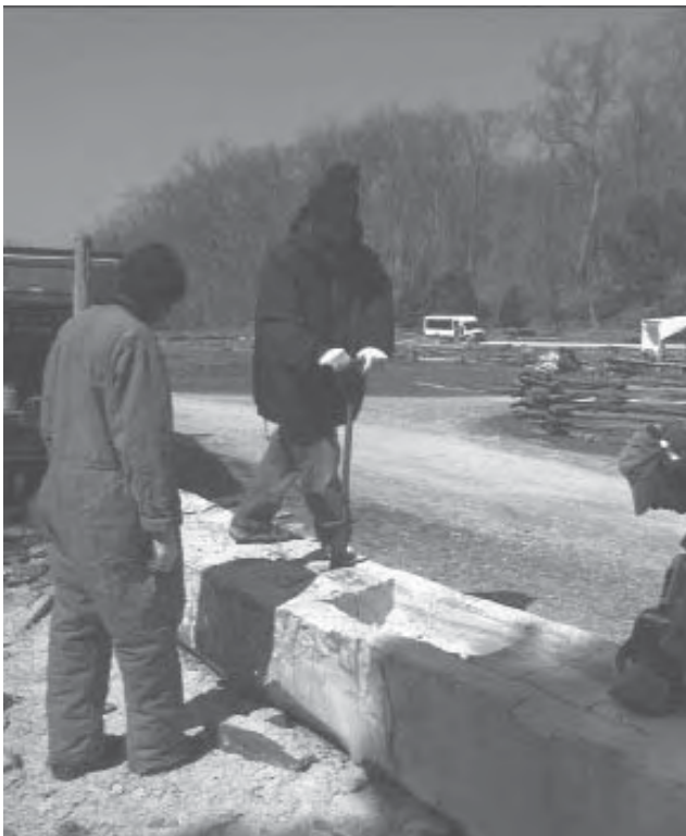
Chunking out the inside. Getting ready for the burn